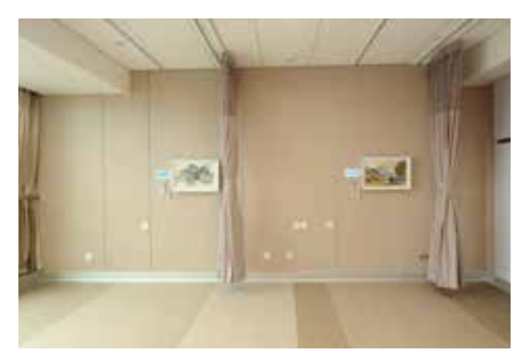
▼ Office area