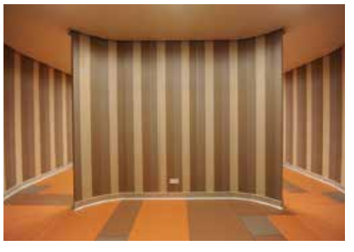
▲ B ultrasonic room

Having characteristics of mold and mildew resistant, Tedlar® wallcovering doesn't support bacteria growth, which enables its usage in labor rooms and critical areas such as emergency points and diagnostic rooms.